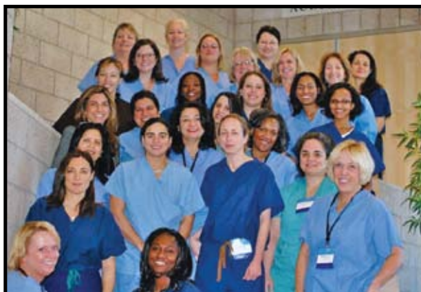
Participants of the First Annual Women in Spine Symposium in Las Vegas in December, 2009.

In spite of all the wonderful accomplishments in 2009, including the highlights and accomplishments showcased in this WINS 2010 Newsletter, the statistics remain somewhat grim: Women now account for 49% of medical school graduates in the U.S., but we represent only 12% of all neurosurgery residents (Figure 1)—less than the percentage of women in general surgery, otolaryngology, thoracic surgery, and orthopedics. Additionally, women represent only 5% of ABNS-certified, practicing neurosurgeons.