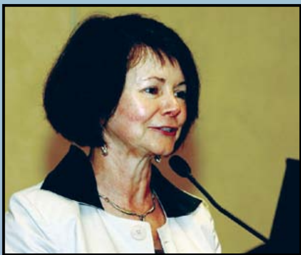
Geraldine Brooks addresses the WINS 20th Anniversary Breakfast Gala in San Diego, 2009

2009 was a spectacular year for Women in Neurosurgery (WINS). This year marked the arrival of the 20th anniversary of WINS, commemorated by our 20th Anniversary Gala at the Annual AANS Meeting in San Diego. Geraldine Brooks, the 2009 Louise Eisenhardt lecturer, addressed the Gala audience, spoke of her career in journalism and as an author, and fielded questions from the audience.